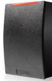
▶ Single Door Module (SDM)