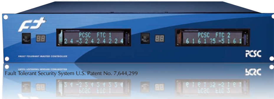
▶ Dual Fault Tolerant Controllers configured with optional 19" 2U rackmount enclosure and optional dual vacuum fluorescent displays

PCSC offers the world's first Fault Tolerant (FT) controller series creating the highest level of reliability with its automated process of system recovery for access control, alarm monitoring and output control systems. The FT Architecture (FTA) is the next evolution of building security management designed with a Virtual Point Definition network, integrated peer-to-peer and redundant communications. The FT system is designed to automatically recover regardless of communication or controller failure.