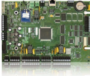
▶ Dual Door Module (DDM)